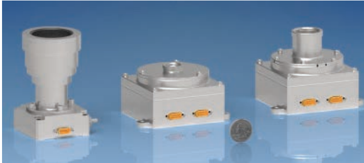
Size comparison: ASTRO CL and ASTROtir with two different lens options